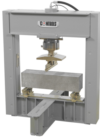
Testing FRC beams - Parallel testing mode