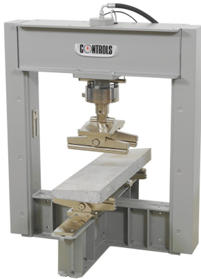
Testing long specimens - Orthogonal testing mode

* The vertical daylight can be reduced by using the distance pieces already included useful to reduce the daylight by: 50mm and 100mm. Additional distance pieces are available as Accessories.